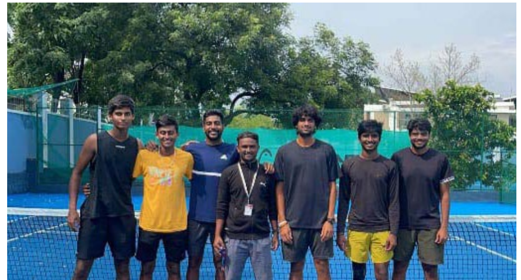
KL university Tennis team, University Winners All India University winners Khelo India Team