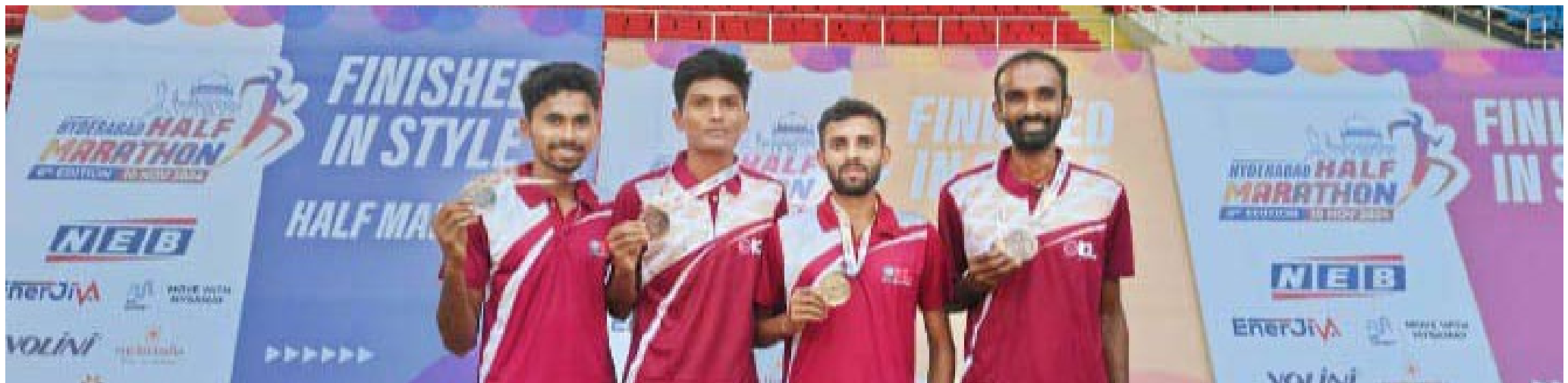
Congratulations KLH GBS Athletis Hyderabad marathon and Half Marathon championship 2024-2025