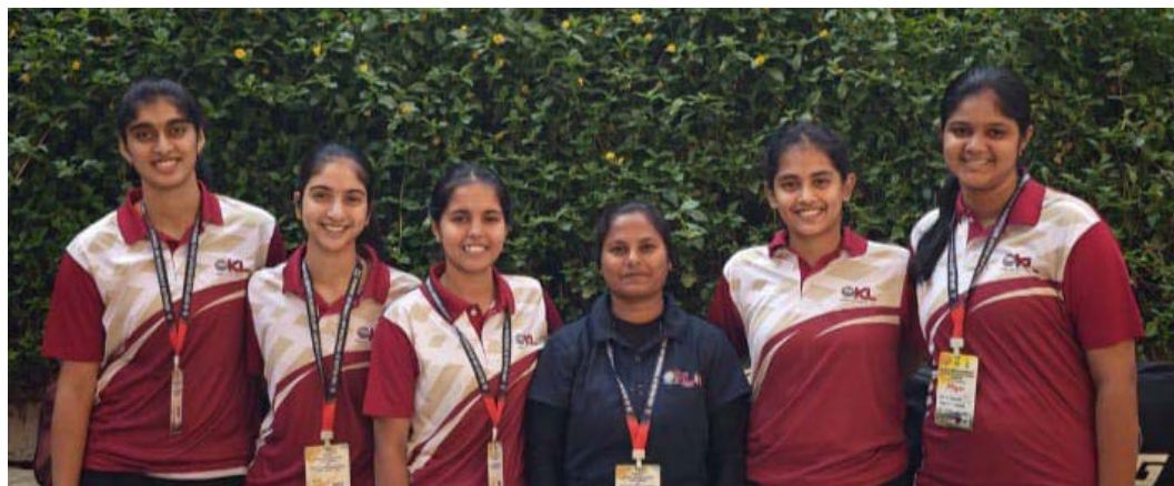
KL university Badminton WOMEN Team 2025