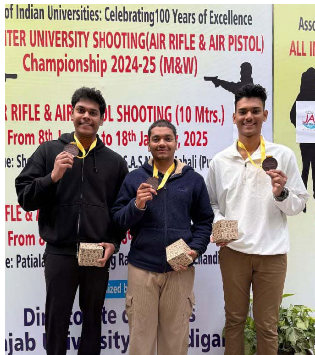
Congratulations students All India University Games Boys Team Air Rifle Shooting 3 rd place 2024-2025