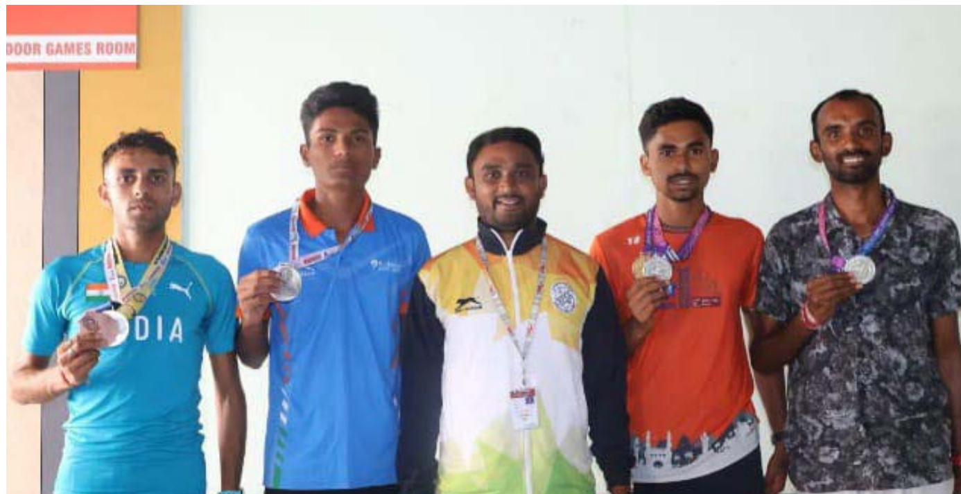
Congratulations all Athletes BBA students Junior National medalist and overall Championship 2025