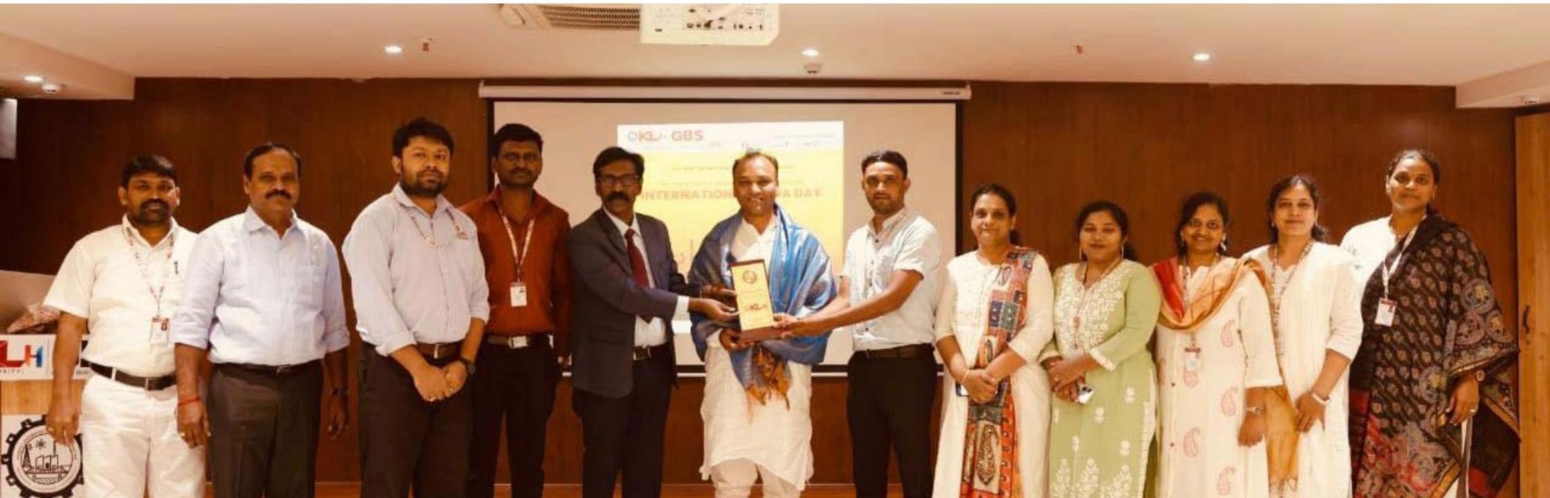
International Yoga Day in KLH GBS 2025