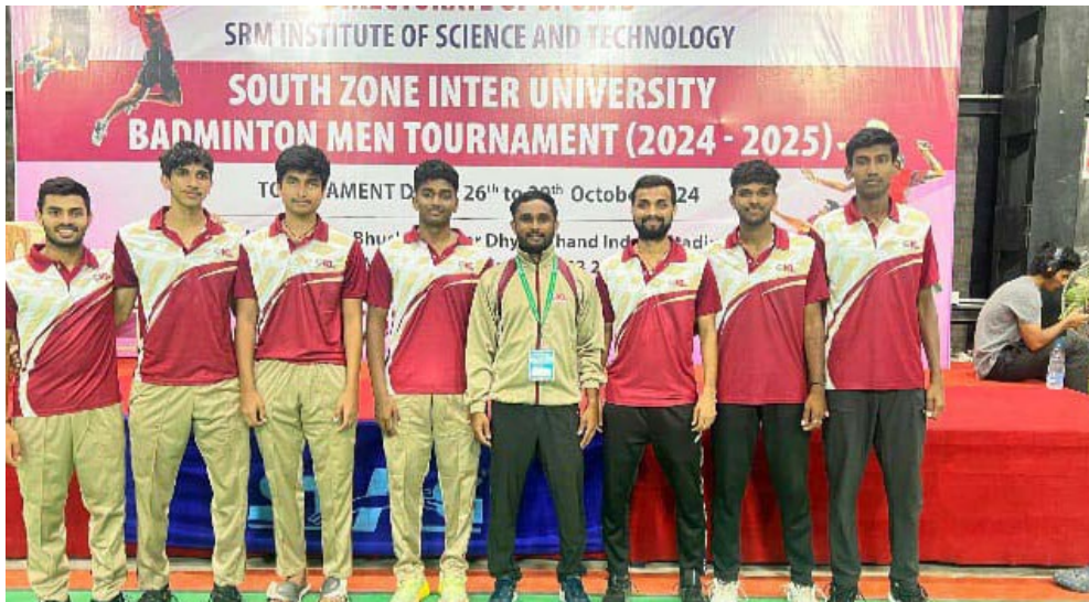
KL university Badminton Men Team 2024-2025